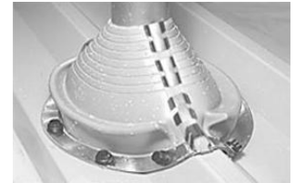
Zipseal - Springseal