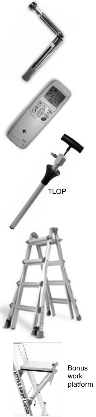
Little Giant Accessories